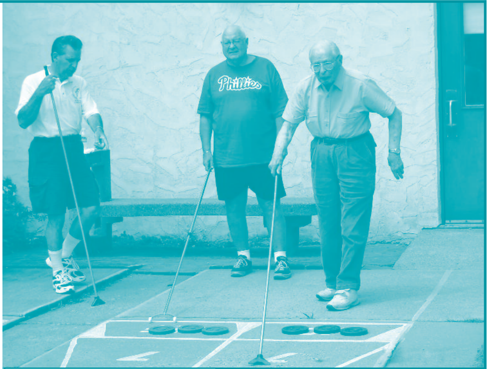
3 generations of participants having a good time at the 2009 Games

Funded by: Independence Blue Cross and Keystone Health Plan East, Pennsylvania Department of Aging, Bucks County Area Agency on Aging, Bucks County Department of Parks and Recreation