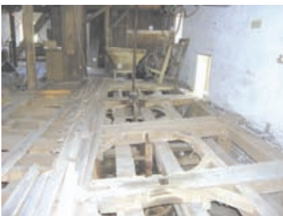
Millstone frame with stones removed