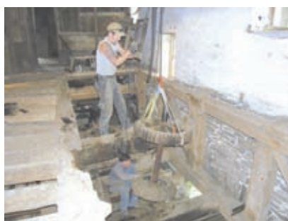
Raising a turbine shaft with two drive gears