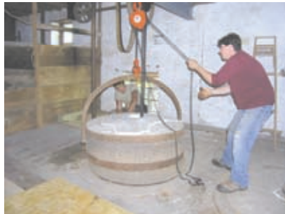
Lifting a 2300 lb. runner stone