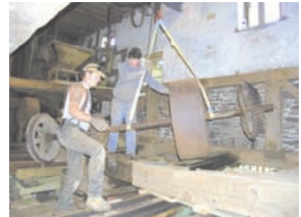
Hoisting the drive shaft