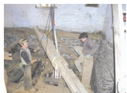
Removing the top sill of the millstone frame