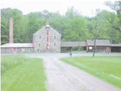
Stover -Myers Mill